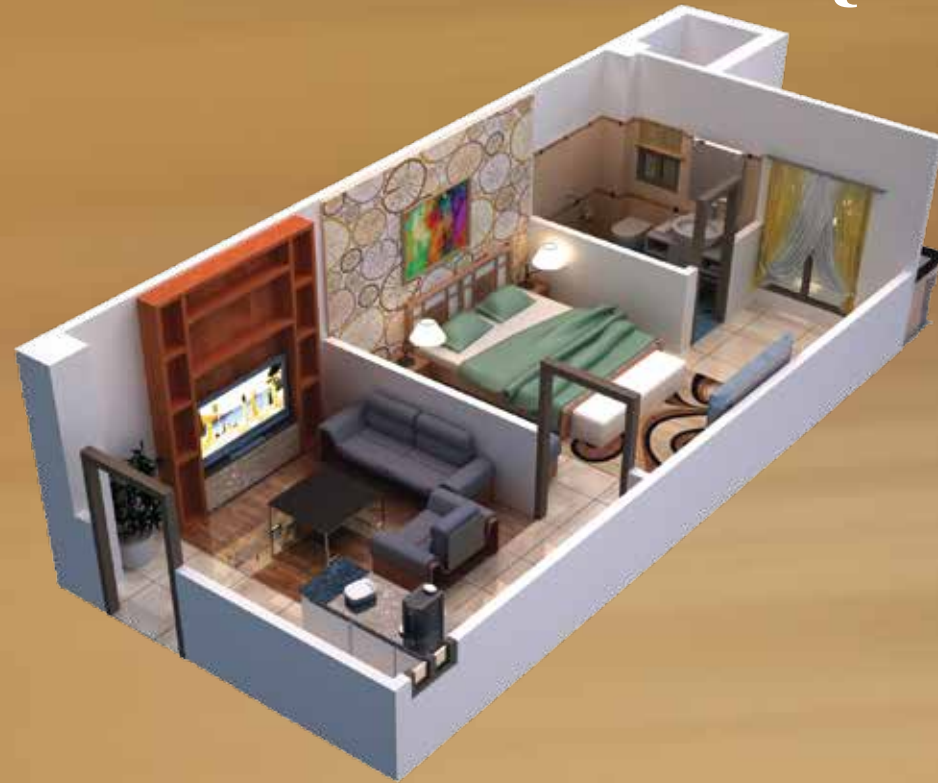
1 BED APARTMENT