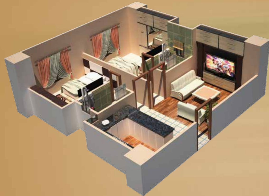
2 BED APARTMENT