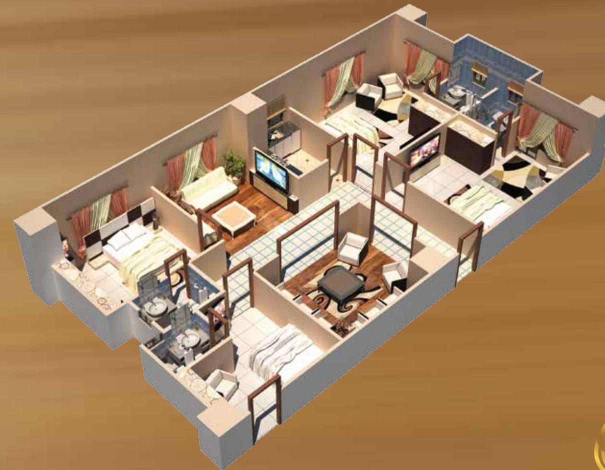
4 BED APARTMENT