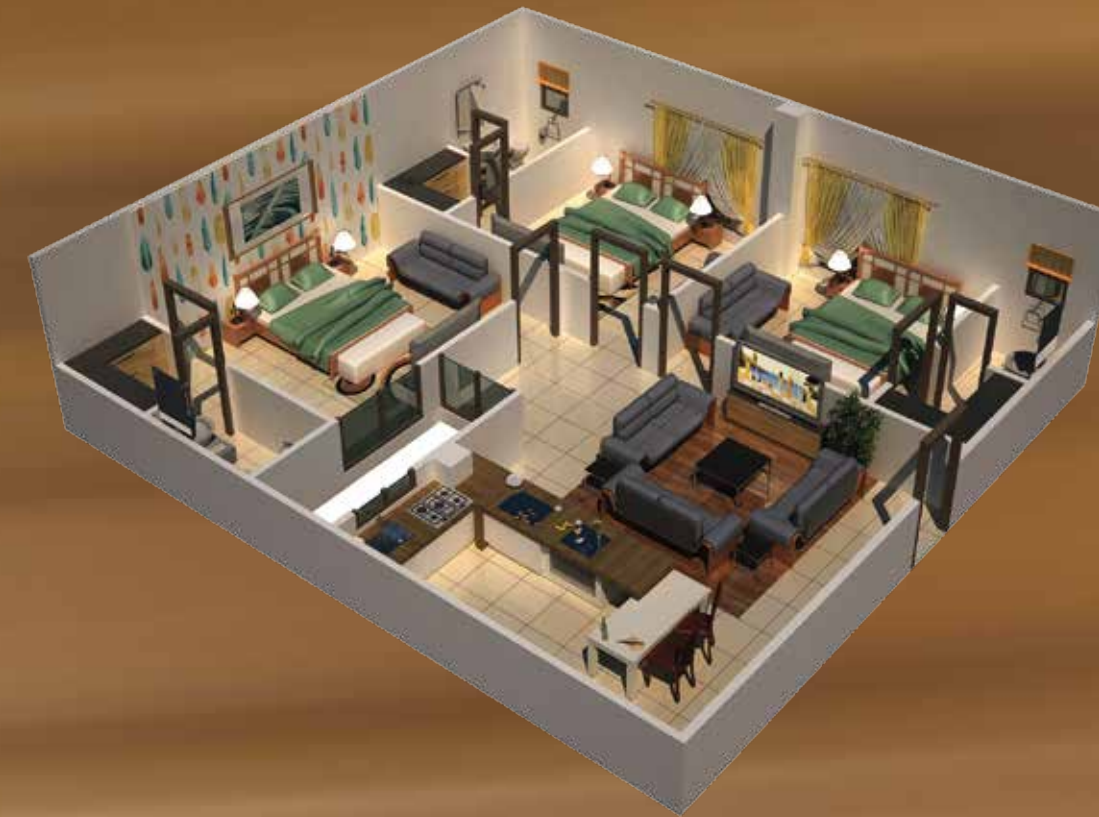
3 BED APARTMENT