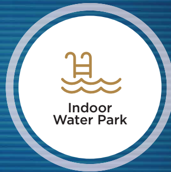
Indoor Water Park